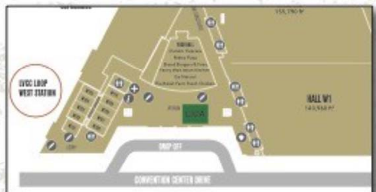
West Hall Map: LICA Booth (WL2000)