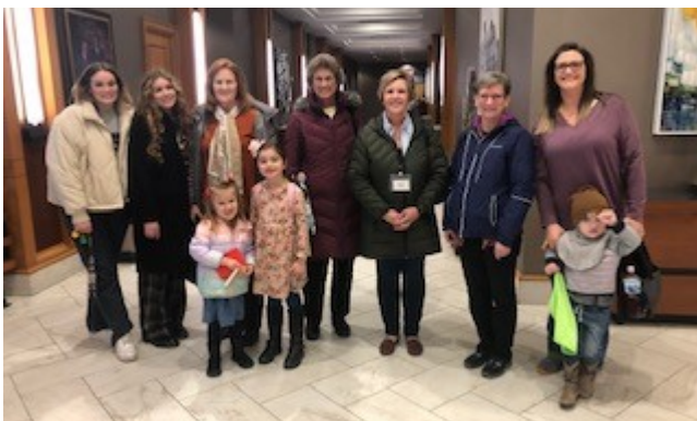
Ladies Group heading out for The Cake Bake Shop