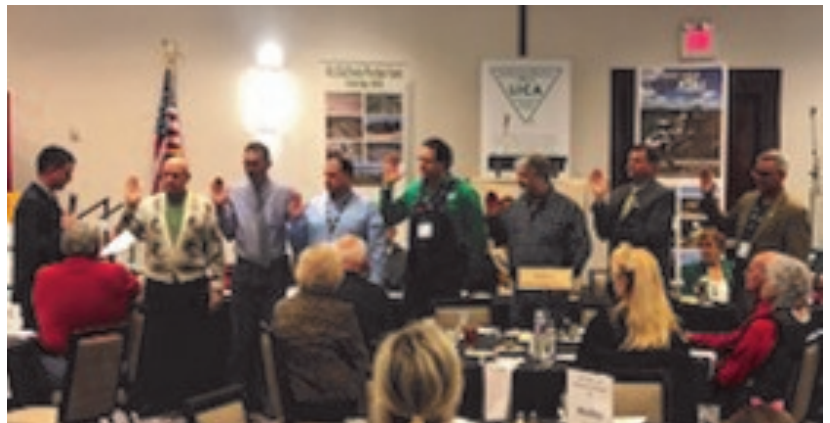
Right: Swearing in of the 2020 INLICA Board Members