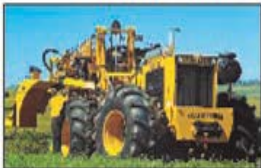
Buckeye 7200 Magnum