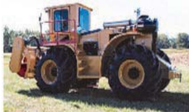
Buckeye 350 Backfiller

Farm Drainage - Pipeline - Construction - Wind Farm