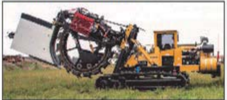
Buckeye 9200 Magnum/Track Option