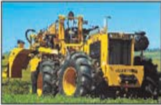
Buckeye 7200 Magnum