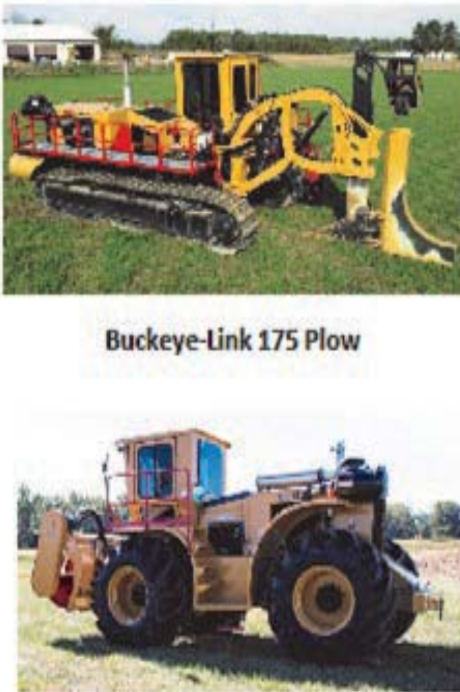
Buckeye 350 Backfiller

Farm Drainage - Pipeline - Construction - Wind Farm