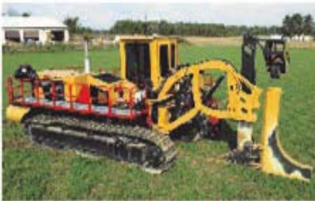
Buckeye-Link 175 Plow